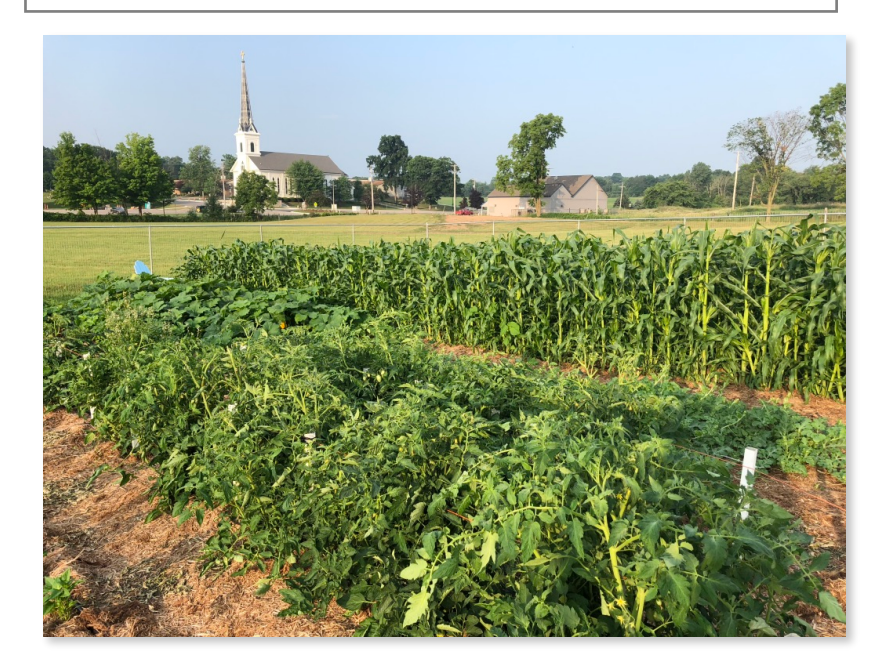
UPRISE Work of Mercy : Garden for God's Kitchen, Grand Rapids, MI June, 2018